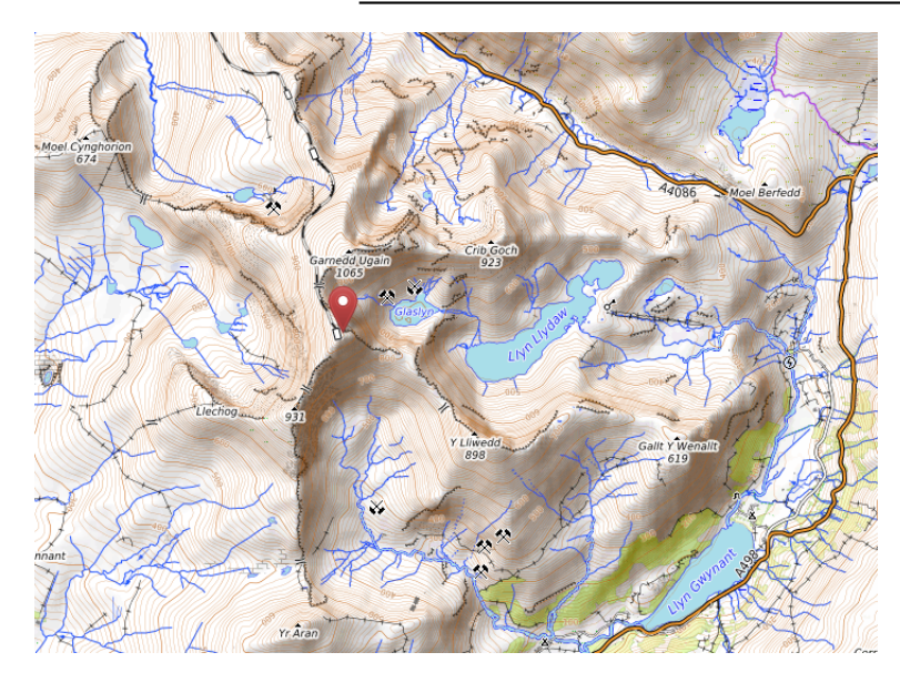
Map data: © OpenStreetMap-Mitwirkende, SRTM | Map display: © OpenTopoMap (CC-BY-SA)

The map to the left shows Snowdon and the surrounding area. Snowdon summit is marked with the symbol.